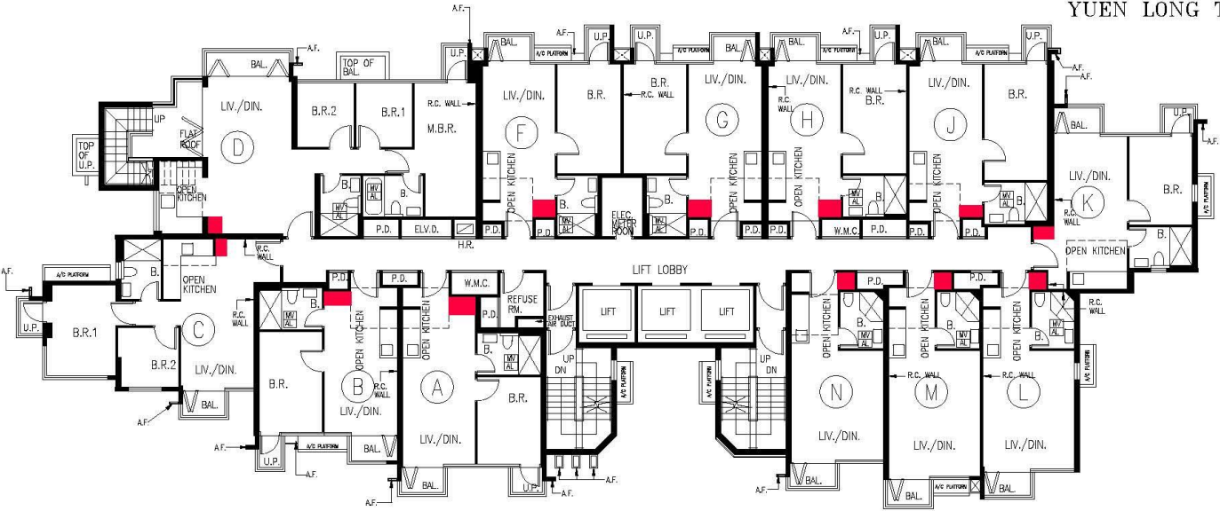
26TH FLOOR PLAN